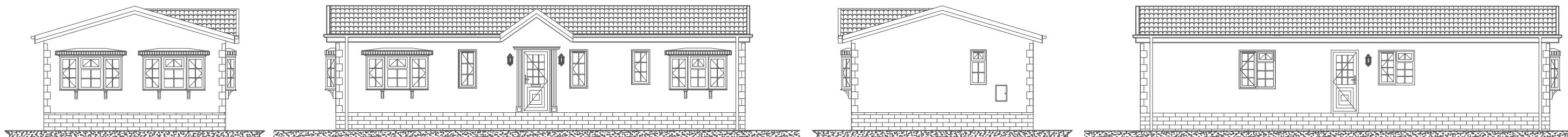
(C) Elevation (A) Elevation (D) Elevation (B) Elevation

This home is designed in accordance with BS3632